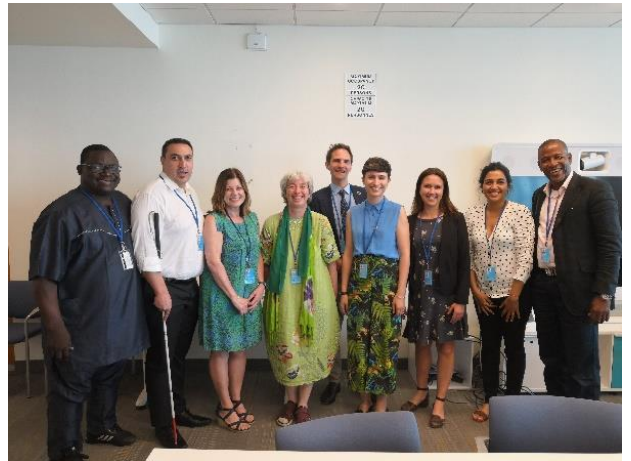
Together 2030 members at the Strategy Meeting